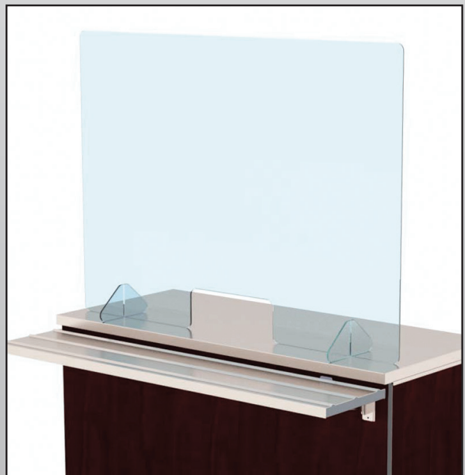
Model MAB-4724 (flat counter top application)